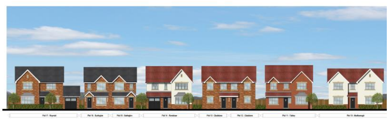
SECTION B - B